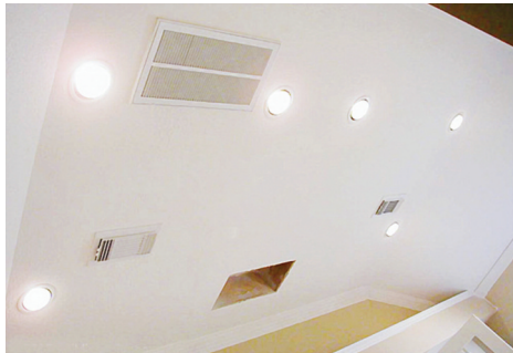
Incandescent light fixtures in the ceiling below the attic can often generate enough heat to melt snow on a roof.

Prevention remains the most effective strategy for stopping ice dams. Homeowners can take several steps to prevent heat from escaping your attic or the interior of your house.