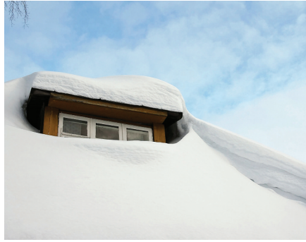
Snow can collect behind roof obstructions, such as the ones pictured above. These include vents, chimneys or gables

In the aftermath of significant snow or ice event, there are several important indicators a homeowner can use to determine if a sloped roof is under structural stress from snow or ice. The Canadian Mortgage and Housing Corporation (CMHC) recommends that homeowners check for 1 :