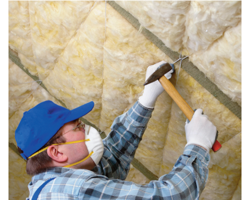
Fibre glass insulation can significantly reduce heat loss from your home.

There are also a series of less costly steps a homeowner can take if ice dams are a continuing problem. Increasing the insulation above your ceilings can help prevent heat from escaping into your attic or through your roof. For suspended ceilings, fibre glass batt insulation can be installed to prevent heat loss. For drywall ceilings that are nailed directly to the joists, blown insulation in addition to fibre glass insulation can be effective.