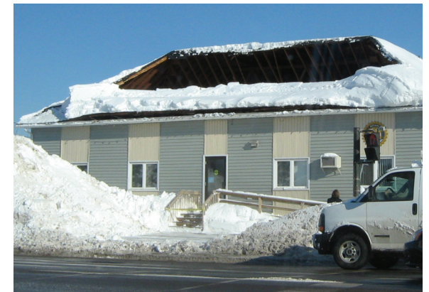
Roof collapse can be a stressful and expensive experience for homeowners..

But even with a sloped roof, snow and ice can still build up on flatter areas of the roof. Obstructions, such as chimneys, skylights or dormers, are particularly susceptible to snow build-up.