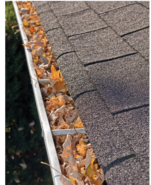
Blocked gutters can stop water from draining from your roof and cause ice dams.

For some homes, especially those with aging drainage systems that are surrounded by trees, this type of preventative maintenance may still not stop ice dams. In this case, a heating cable installed on the gutter or downspout may be necessary.