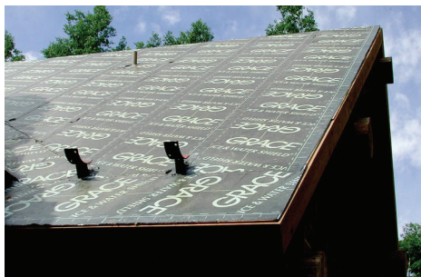
Snow and ice shield.

Re-roofing also offers another opportunity to prevent ice dams. During installation homeowners can install a secondary moisture or snow and ice barrier to prevent heat loss. To make sure the barrier is effective homeowners should consider using two layers of underlayment that are cemented together.